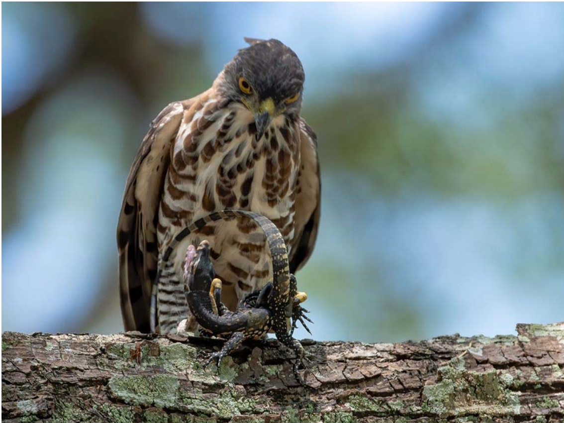
Crested Goshawk, with a young Water Monitor Lizard that it had caught, at Pasir Ris Park, on 13 Feb 2020

February might just be the peak breeding period for the Crested Goshawk , as breeding-related activities were observed at five different locations: on the 5th, a nest with one chick was recorded at West Coast Park; on the 10th, courtship feeding was observed between a pair which had built a nest at Pasir Ris Park; the goshawk at Ang Mo Kio on the 10th was apparently nesting for the second season; at Pasir Panjang, an active nest with two chicks was observed throughout the month; and at Thomson, a nest with two chicks was recorded during the month, although only one chick survived.