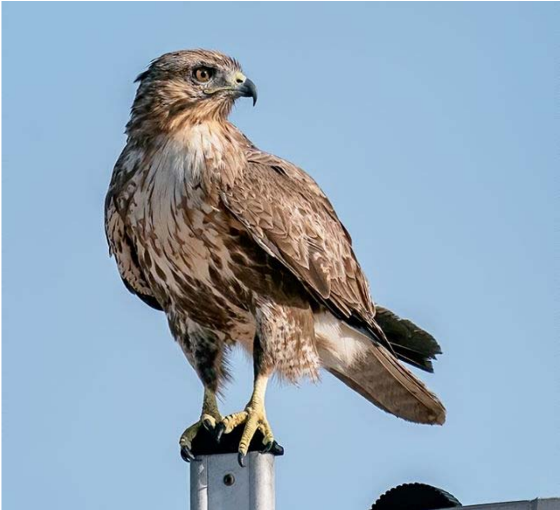
Common Buzzard, juvenile pale morph, at Bedok North Avenue 3, on 27 Feb 2020, by Danny Khoo