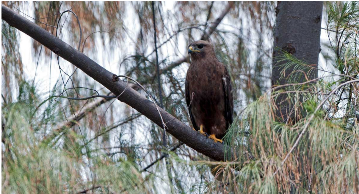
Common Buzzard, Tanah Merah, 050311