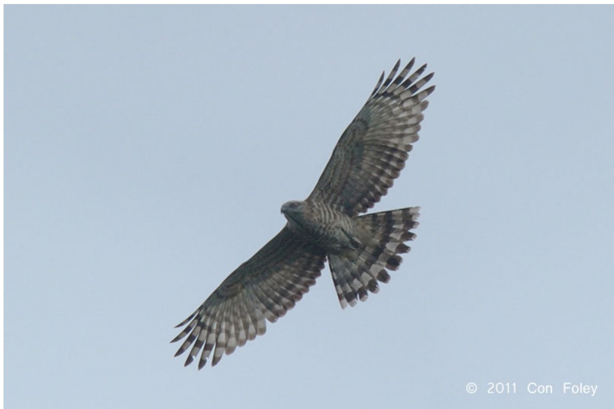
Jerdon's Baza, at Changi Cove on 130311