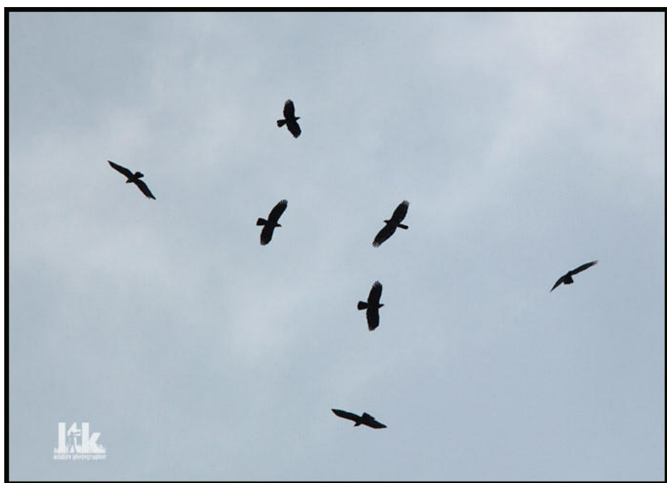
A kettle of Oriental Honey Buzzards, at Changi Cove on 250311