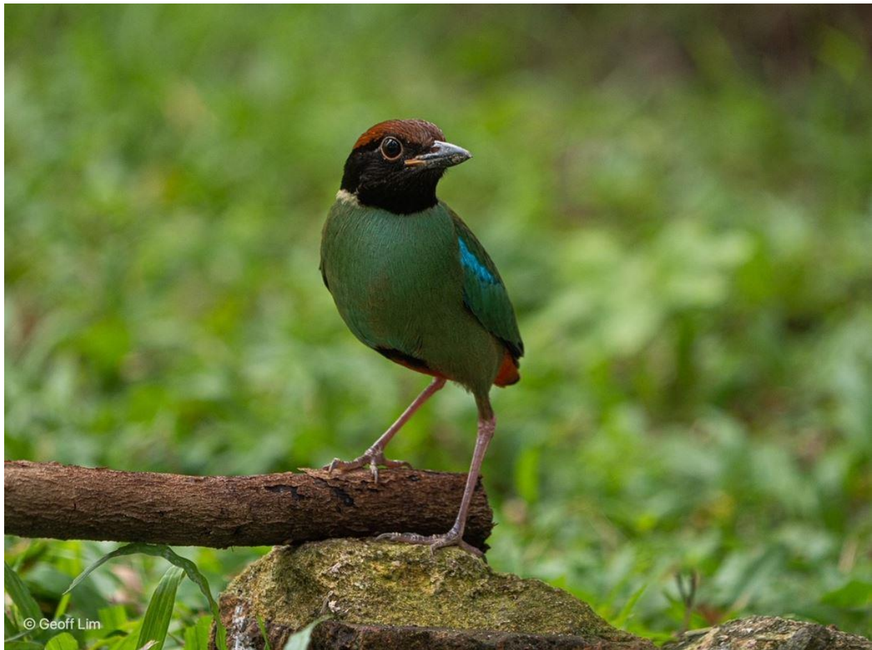
Hooded Pitta, 15 November 2021 at Tampines St 42 by Geoff Lim.

In the meantime, a Hooded Pitta , Pitta sordida was found at the hedges beside the multi-storey carpark at Blk 450B Tampines Street 42 and reported in eBird on 15 Dec 2021 by Alan Tan. At East Coast Terrace on 1 Dec 2021, a Chestnut-winged Cuckoo , Clamator coromandus , was found dead on a ledge by Tok Sock Ling, while on 6 Dec 2021, a Blue-winged Pitta , Pitta moluccensis , was photographed in a passenger lift at an apartment block at Bedok North Street 3 by Andy Lim who reported that the pitta flew out after a ride.