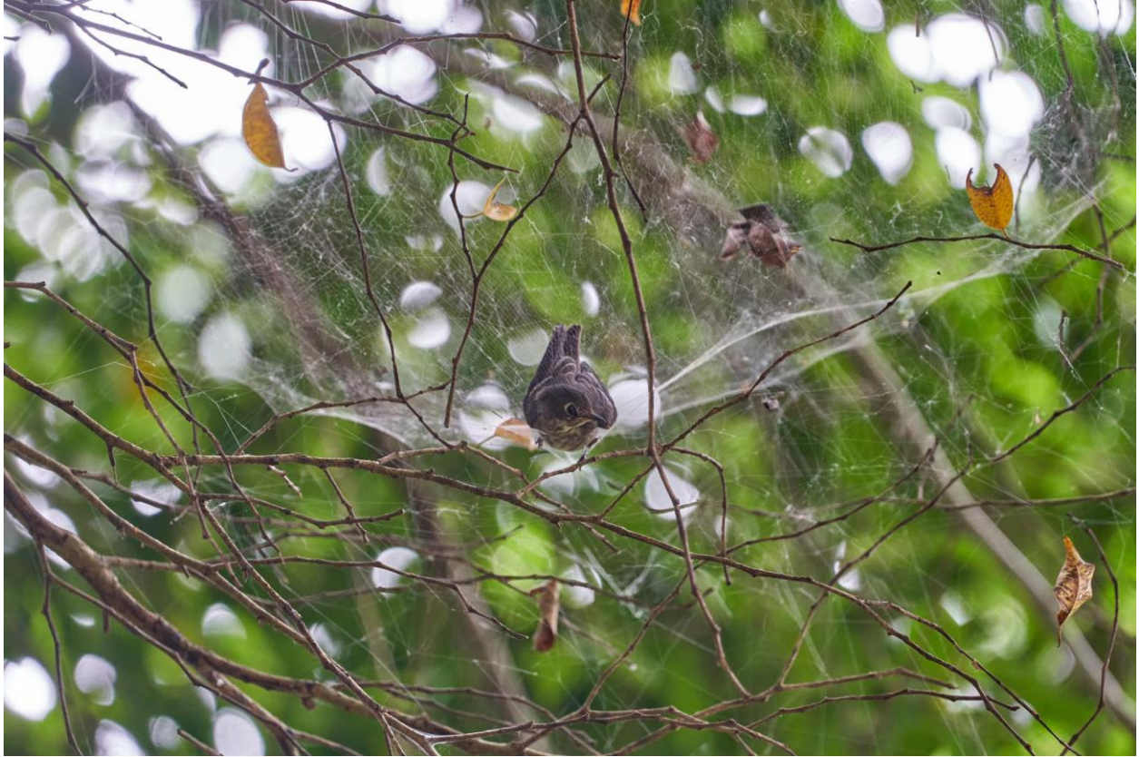
Dark-sided Flycatcher trapped in spider web, 9 December 2021 at Dairy Farm Nature Park.