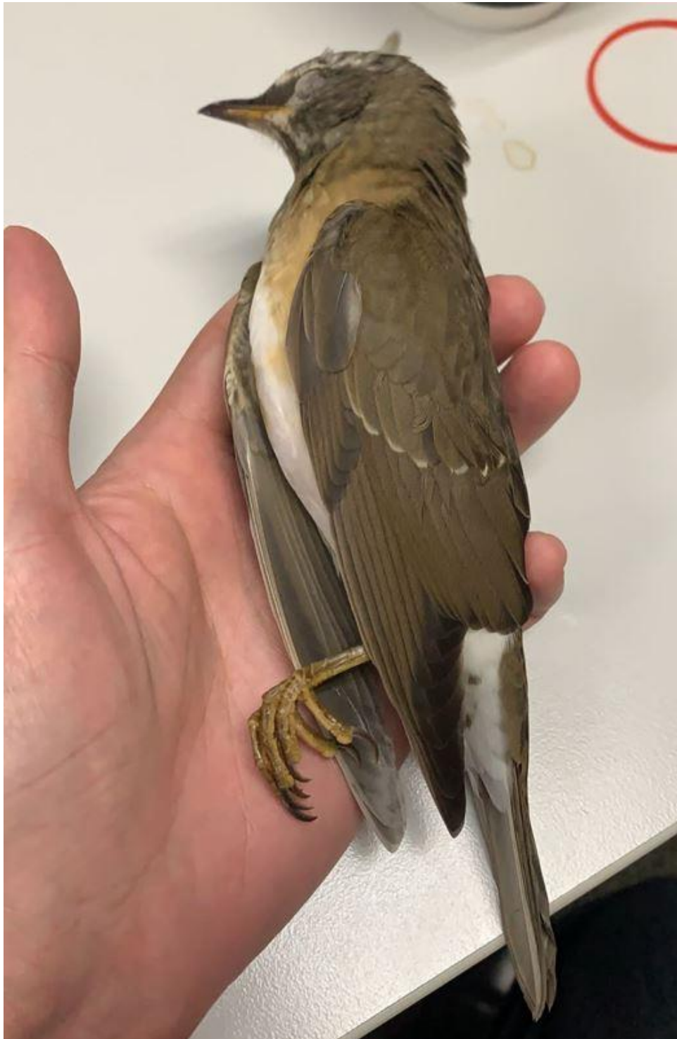
Eyebrowed Thrush, 1 December 2021 at Kay Siang Road.