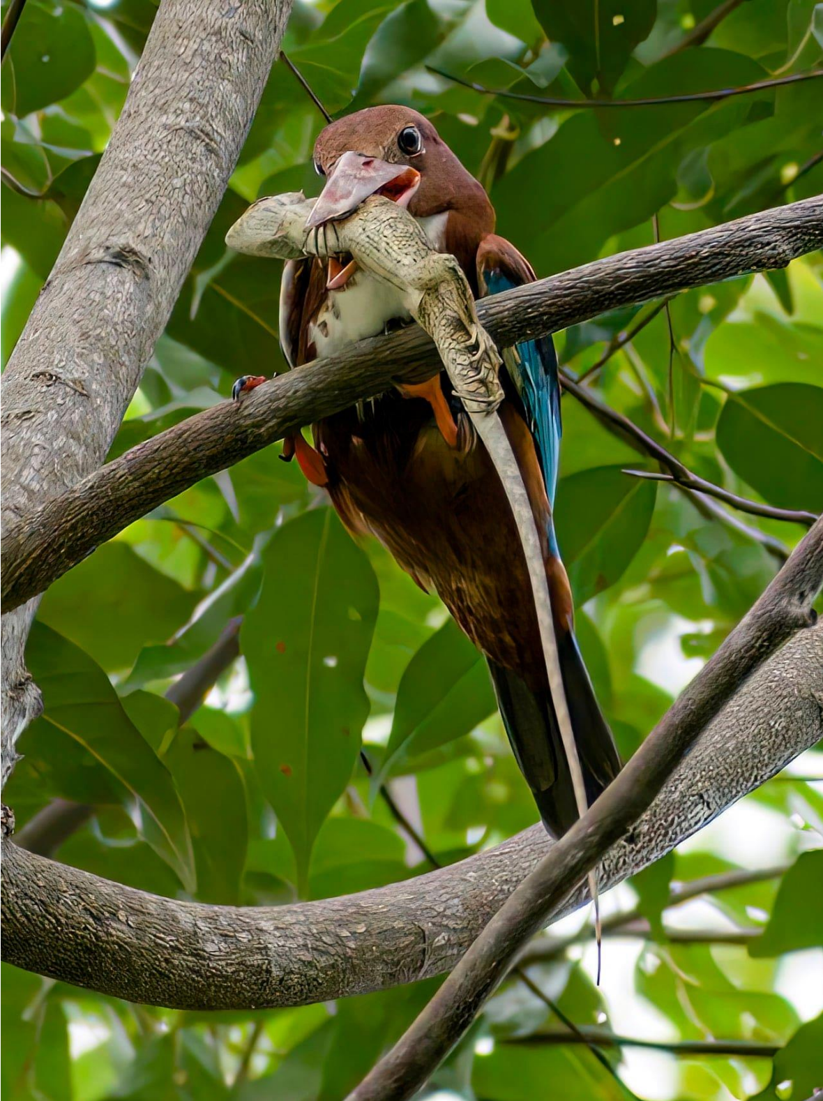
White-throated Kingfisher caught a Changeable Lizard, 14 December 2021 at Pasir Ris Park.