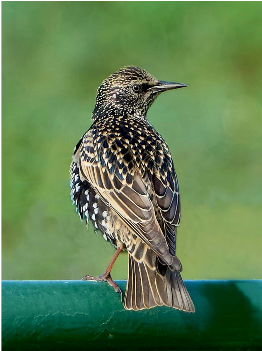
Common Starling, Marina East Drive, 14 Dec 2021

November and December continued with a bull run of rarities, with the year culminating with the sad but spectacular arrival of five Himalayan Vultures and Singapore's first record of a Cinereous Vulture at the Singapore Botanic Gardens. No less exciting were the first ever record of another four species for the country – the Black Redstart, the Pale-legged Leaf Warbler, the Long-eared Owl, and the Common Starling. In addition, we had the second ever sighting of the Grey-streaked Flycatcher, thirty years after the first.