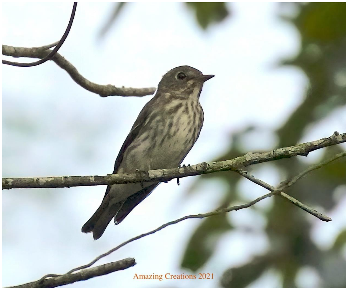
Grey-streaked Flycatcher, 15 November 2021 in Sembawang.