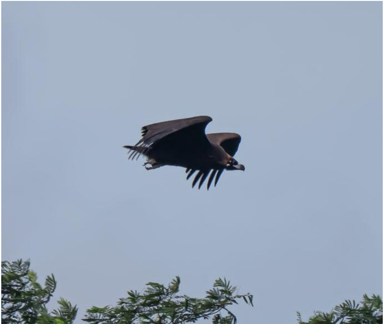
Cinereous Vulture, 30 December 2021 at Singapore Botanic Gardens by Geoff Lim.

Visitors to SBG spotted a Dark-sided Flycatcher , Muscicapa sibirica , on 12 Nov 2021 (Vincent Chin) and a Malaysian Hawk-Cuckoo , Hierococcyx fugax , on 27 Nov 2021 (Steven Woon). The following month, a male Blue-and-white Flycatcher , Cyanoptila cyanomelana , was photographed on 1 Dec 2021 by Frankie Lim, and a single Himalayan Vulture , Gyps himalayensis , was spotted on 8 Dec 2021 by Marcel Finlay. Other species seen within the month included a Red-legged Crane , Rallina fasciata , on 9 Dec 2021 (Kwok Tuck Loong), a surprise find of a Little Grebe , Tachybaptus ruficollis , on 11 Dec 2021 by Tan Chuan Yean, a Common Moorhen , Gallinula chloropus , on 15 Dec 2021 (M Tay), a Mugimaki Flycatcher , Ficedula mugimaki , on the same day (Vinchel Budihardjo) and a Black-crowned Night Heron , Nycticorax nycticorax , on 16 Dec 2021 (Elisha Lee). These were followed by the spectacular sighting of the five Himalayan Vultures and a single Cinereous Vulture , Aegypius monachus , on 29 Dec 2021 by Cecilia Lee and Justin Jing Liang.